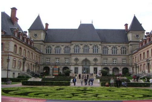
Cité Internationale Universitaire

Each day, the conference starts at 09:30, and ends at 18:30, with a lunch at around 12:00.